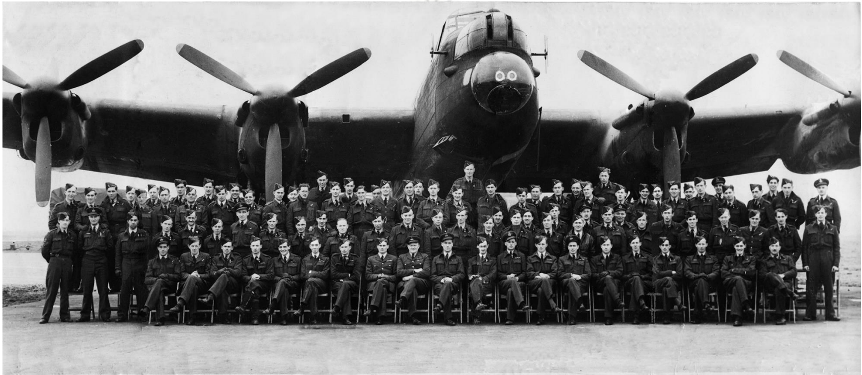
75(NZ) Squadron RAF.